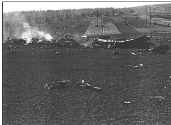
The crash site on December 25, 1944,