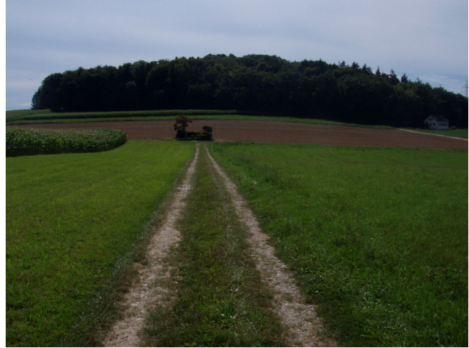
The former crash site, looking from North to South