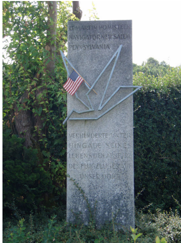
The Monument as it exists today