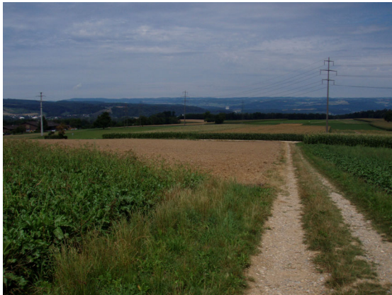
A view over the landscape around the former crash site. Notice the Black Forest mountains (Germany) at the horizon.