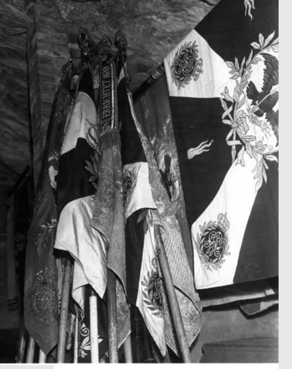
More than 200 German regimental flags, dating from both the early Prussian wars and the World War I era, were hung above the coffins.

shrine marking the supposed resting pace of St. Elizabeth, a Hohenzollern ancestor. The north transept, cut off from the choir, nave, and crossing by screens and metal gates, could thus be kept closed to public view without arousing curiosity or impairing the fabric of the building.