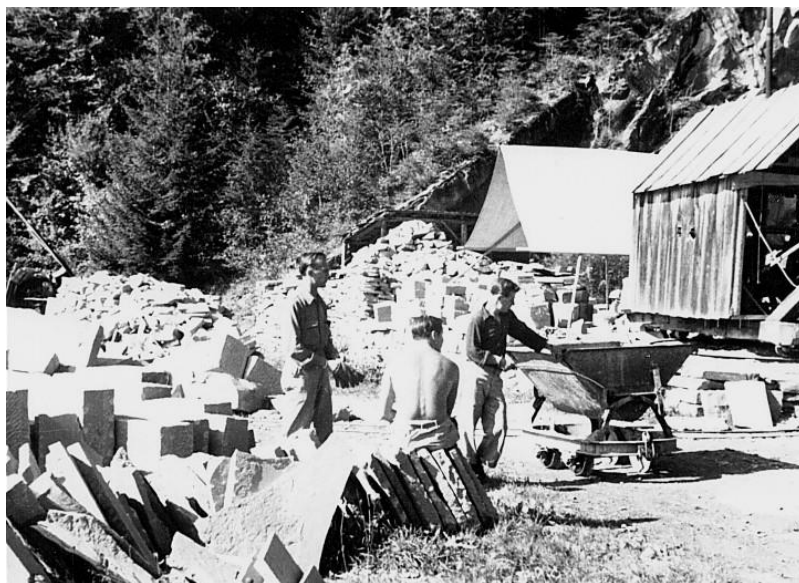
Quarrying rock at Marsens