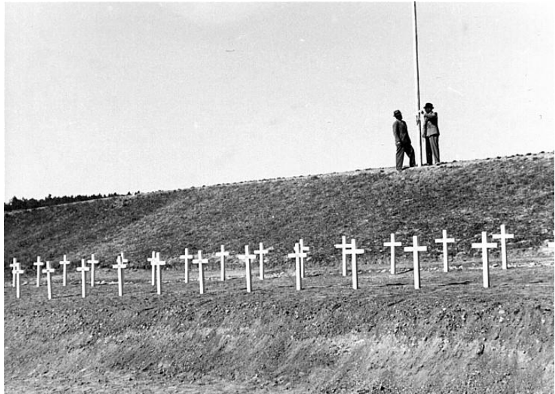
Münsingen Cemetery before construction was started