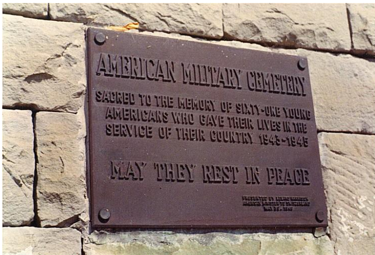
Plaque on the wall of the cemetery today