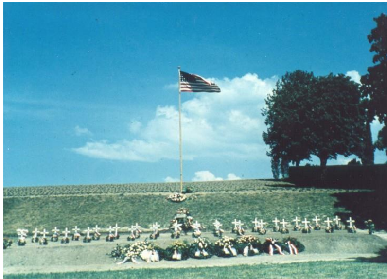
After dedication of the cemetery ("Mac" MacSpadden)

millions of such crosses in all the countries of the world. Sleep well your last rest in peaceful earth, brave soldiers from a great distance. May your blood not have been shed in vain.