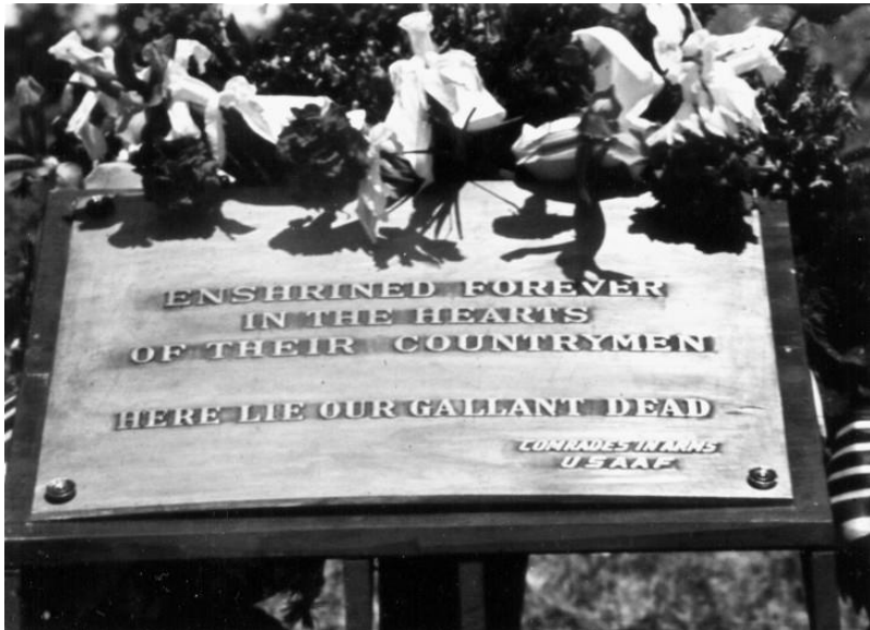
Memorial plaque installed at the American Military Cemetery at Münsingen, Switzerland:

“ENSHRINED FOREVER IN THE HEARTS OF THEIR COUNTRYMEN HERE LIE OUR GALLANT DEAD